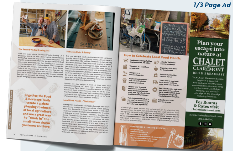
1/3 Page Ad