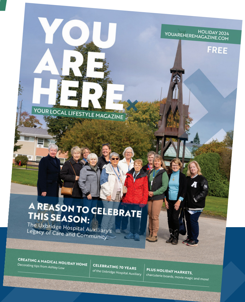
Holiday 2024 Cover