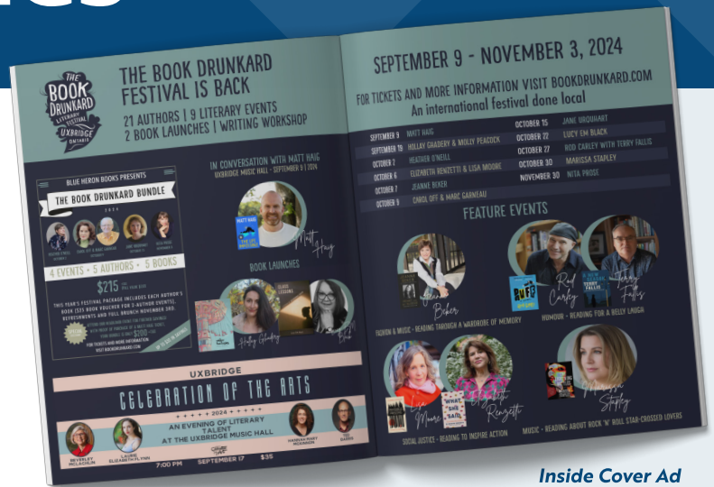
Inside Cover Ad

We welcome the opportunity the opportunity to partner with a local business to sponsor a food or drink recipe for readers to enjoy.